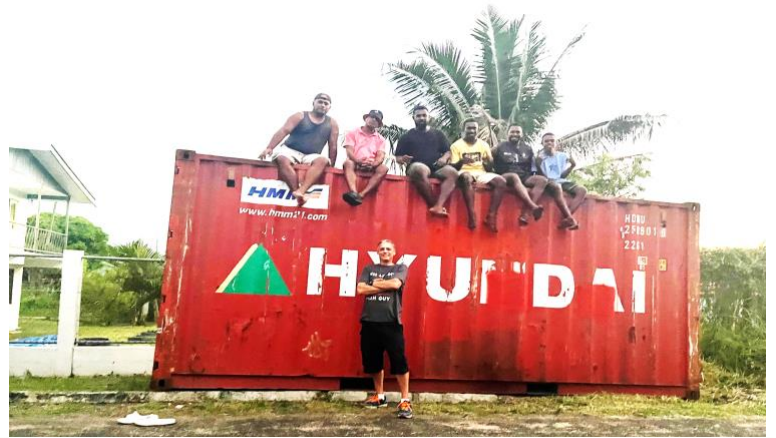
The Crane lifting the Shipping Container over into our yard where we can securely access the resources!

With the help of our Fijian AOG partners here on this side we were able to go to the highest levels of customs officers in the nation and get the charges cut in half!