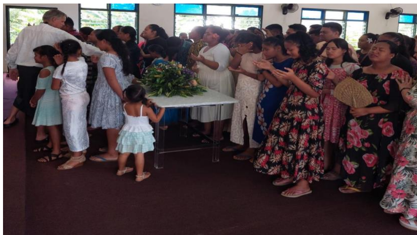
A wonderful move of the Holy Spirit in Faleula, Samoa stops me in my tracks right there praying over that child.

Even in Samoa where we went simply to help a new missionary family settle in we experienced an outpouring of the Holy Spirit. We were asked to speak in the church of the Superintendent of Samoa, and I was simply sharing the concept of the church's responsibility to equip the parents to be the primary discipleship agents of the children, and not trying to relegate that task to Sunday school and Children's Church.