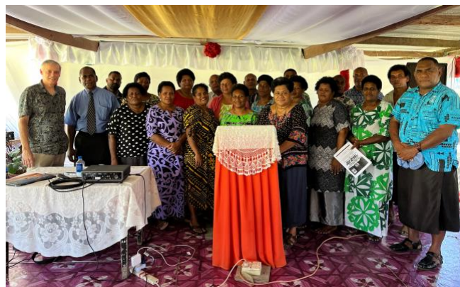
Training Children's Ministry Leaders in Western Division of Fiji

We have seen teachers filled with the Holy Spirit, moves of the Spirit with tongues, interpretations, and prophetic words in the village churches of the highlands, in the city churches along the coast, and we're believing for more of that as we travel this week to the villages in the Yasawa island group.